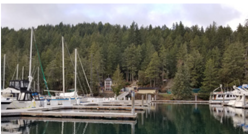
Pleasant Harbor...potential extended cruise destination...lovely destination!