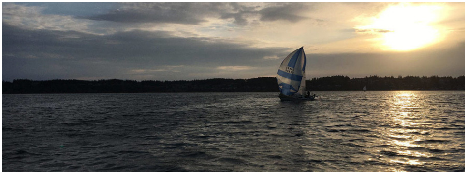
San Juan 24 "SWIFT" racing in the Thursday night series.